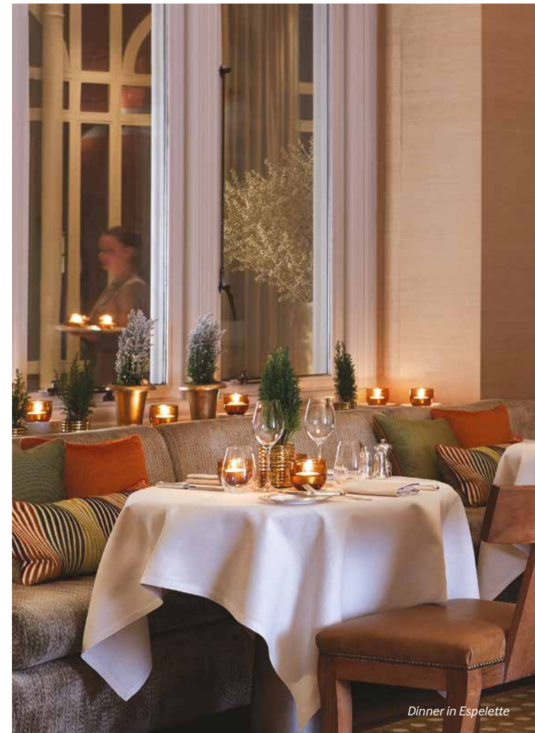
Dinner in Espelette