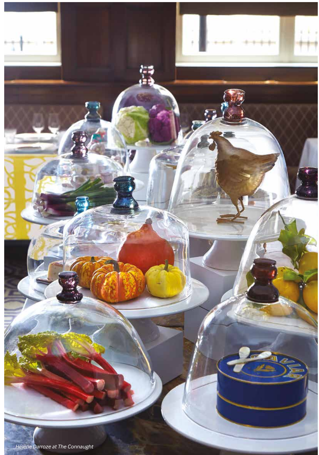
Hélène Darroze at The Connaught