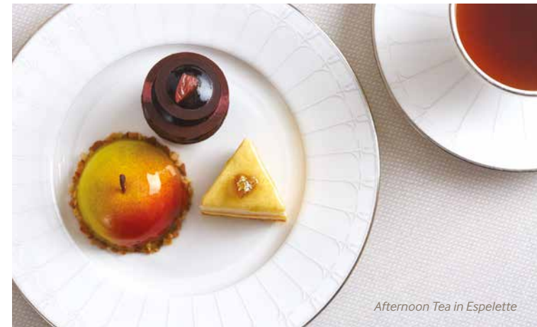
Afternoon Tea in Espelette