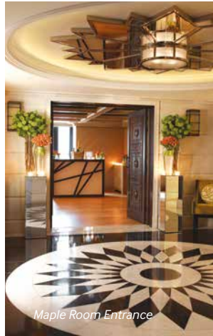
Maple Room Entrance

Within this most revered of hotels are event spaces that marry innovation of facilities with tradition of service. Thanks to expert and dedicated staff The Connaught becomes a stunning and very private place to entertain; from a handful of close friends in the Regency Room to hundreds of guests in Mayfair's first new ballroom in over 80 years.